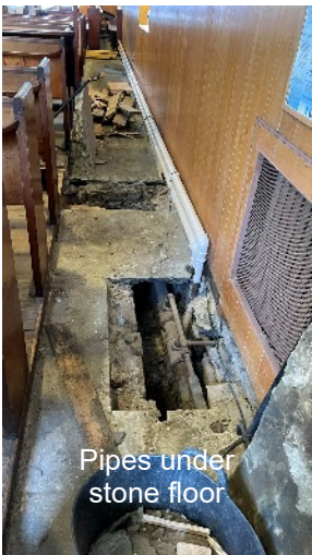
Pipes under stone floor

Meanwhile, outside the rainwater guttering and downpipes, similar to the heating pipes, being made of cast iron, are showing signs of distress, many having cracked, and now leaking. These appear to date from the fifties and sixties. These will be replaced and the suspected blocked ground drainage cleared.