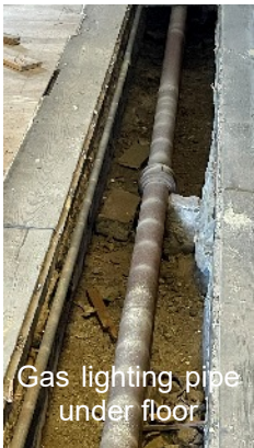
Gas lighting pipe under floor

Will there be more surprises to uncover? I'm sure there will be, but as long as we have the skills to repair and replace we can extend the life of our building, currently 253 years old, well into the 21 st century.